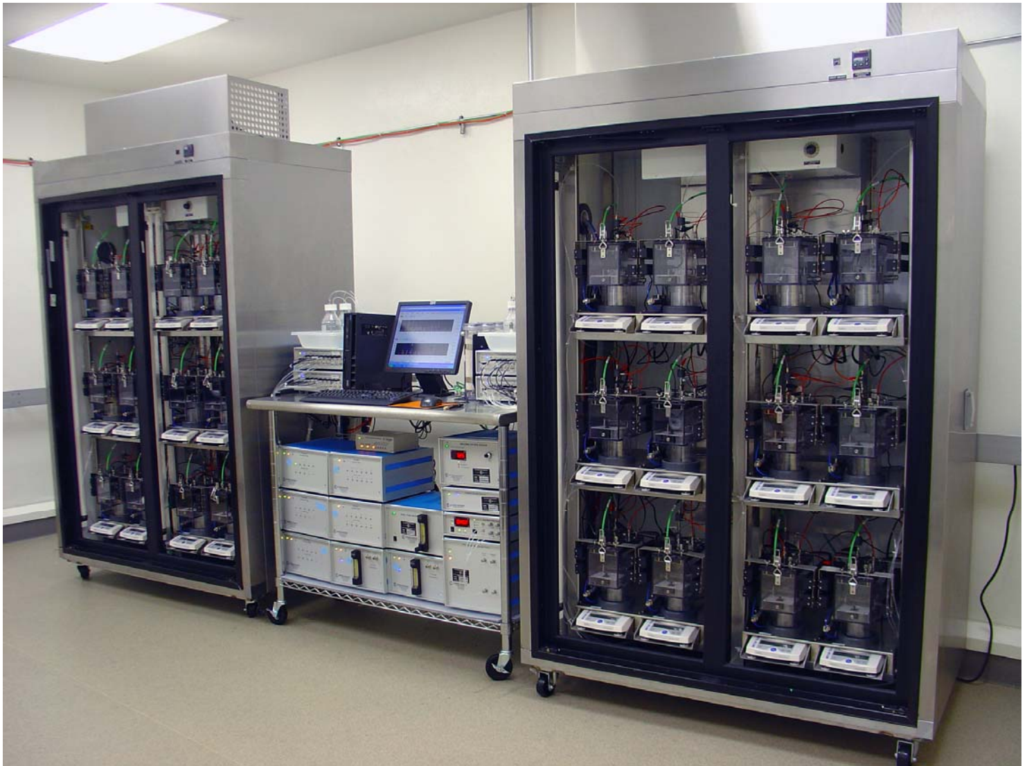
Pictured: Two temperature and light controlled enclosures housing 24 VO 2 /VCO 2 metabolic cages

Accurate assessment of animal behavior and physiology is greatly improved when housed within a temperature range that suits the species under study. For research with mice and rats, this temperature is well above that of the common laboratory environment. Columbus Instruments' Temperature and Light Controlled Enclosures provide a user adjustable environment that offers isolation of multiple animal chambers from the ambient environment as well as control of operating temperature (5° to 40°C) and, optionally, LED lighting (with control of both color temperature and level of illumination). ENC Enclosure units also support rapid "cold challenge" protocols.